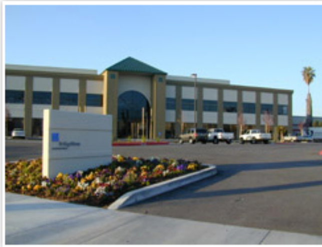
Corporate Headquarters: Santa Clara, CA